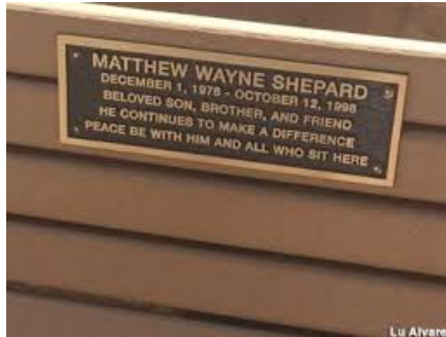
Bench pictured with memorial plaque

At the donor's request, the plaques can be personalized with a message of up to 116 characters. The placement of plaques will be determined on an individual basis. All text submitted for plaques is subject to approval by Town staff.